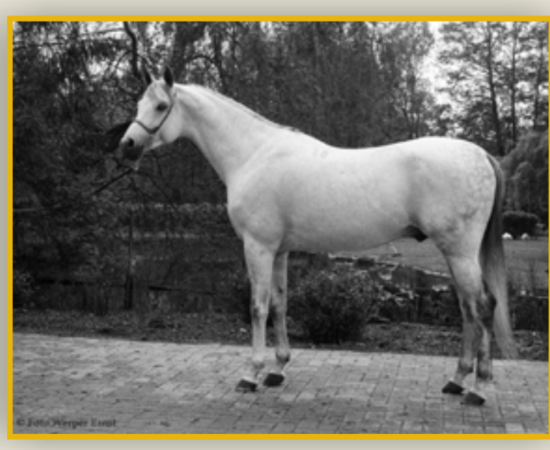
Passat on 1984.