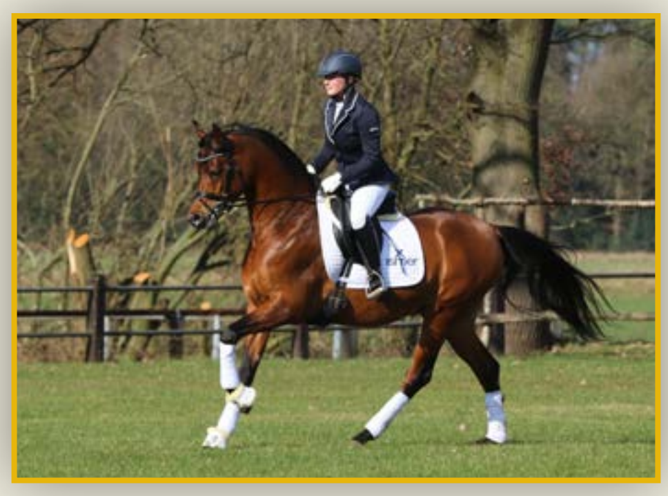
IS Con Air born 2015 (Altis x Castella II by Wermut) Stallion Performance Test Marbach 2018 Bred by Ismer Stud, sold in the meantime